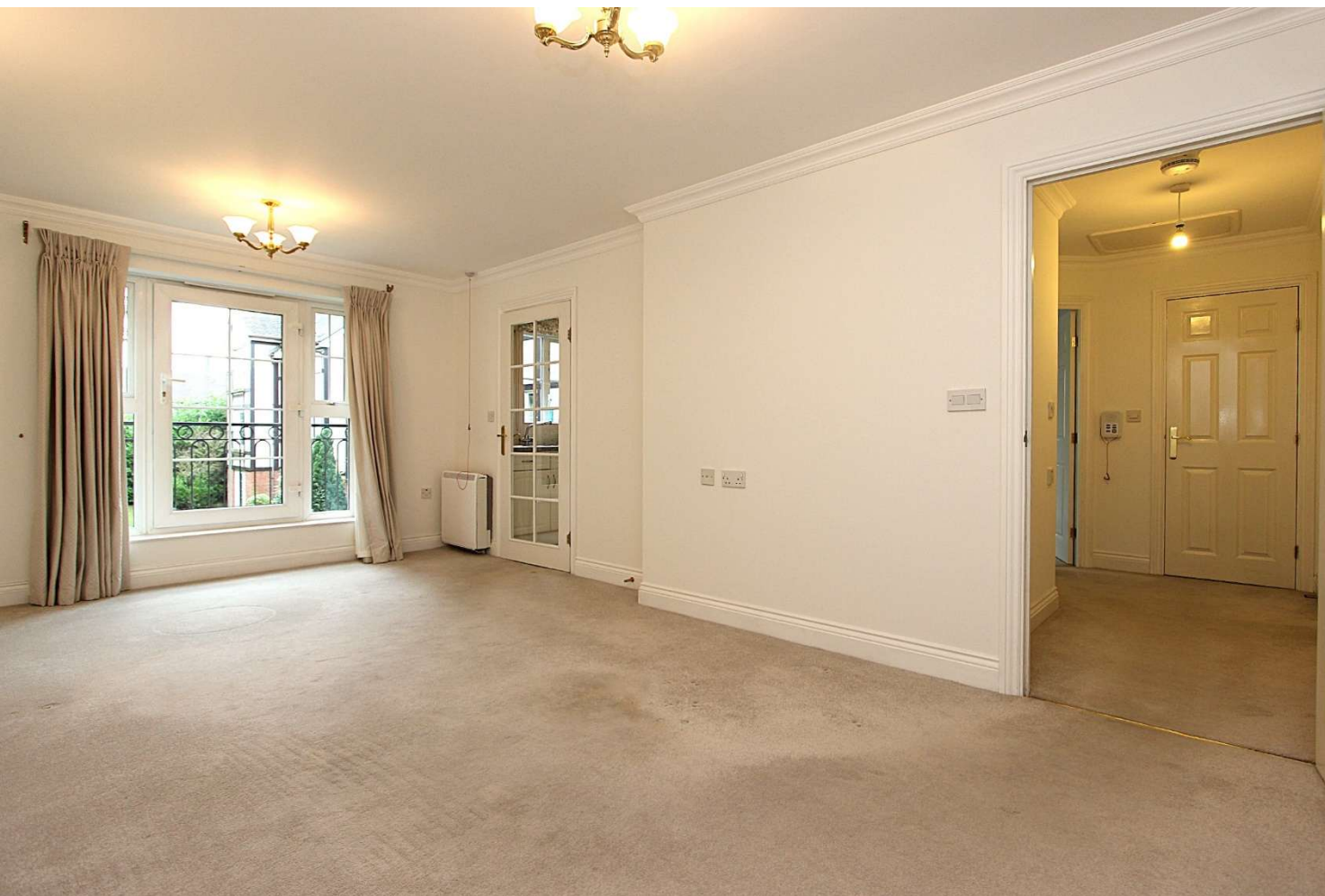
Communal Sitting Room

Bright 18' sitting room with Juliet balcony | Fitted kitchen with Integral Appliance | Double bedroom with fitted wardrobes | Hallway with storage cupboards | Communal sitting room | Laundry Room Provided | Gated resident and visitor parking | No onward chain